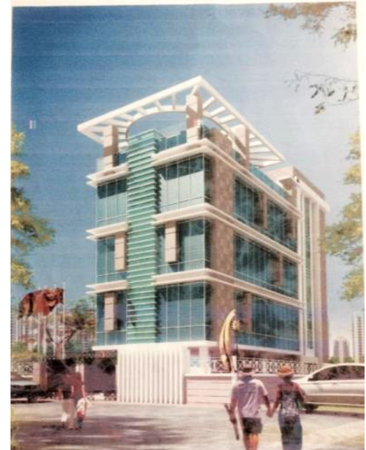
Ideal Tower @ Ramesh Mitra Road